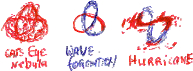
(The Nebula is based on photos taken by a telescope, and the Hurricane is based on the same rules)

A hurricane wave (Coriolis force - Condensed energetic matter) contains a phenomenal amount of energy, which accumulates over time and is released as an independent wave. In fact, one hurricane contains more energy than millions of barrels of oil. The following image displays the wave behavior of energetic matter within a hurricane: